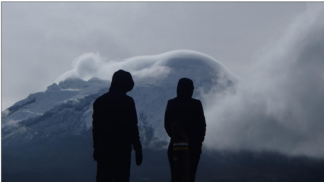
Staring at Antisana from camp

We are a highly flexible company. We can change any item of the program so it fits your needs the best way possible!