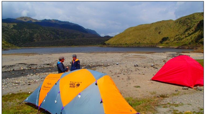
Camp in Volcano Lake