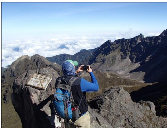
Guagua Pichincha Crater

We start the hike early in the morning, at 7am in the Guagua Pichincha refuge. From there we hike to the summit and then start traversing with ascents and descents to the Padre Encantado summit. Next is Ladrillos summit and finally Rucu summit. After this last goal we head down to Teleferico and take a cable car back to the city.