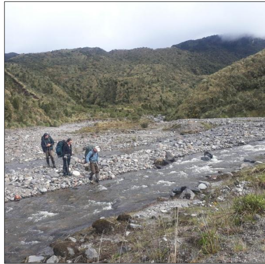
Arriving at Tumiguina Lake Camp

It is much recommended that you train before this program. A couple of weeks for preparation can make a difference. Having previous experience in multi day treks is also very valuable. Setting tents, cooking and all the activities involved in camping can be demanding after several days walking in the mountain. Making these things efficiently will give you more time to eat and rest (if you choose the self-supplied service).