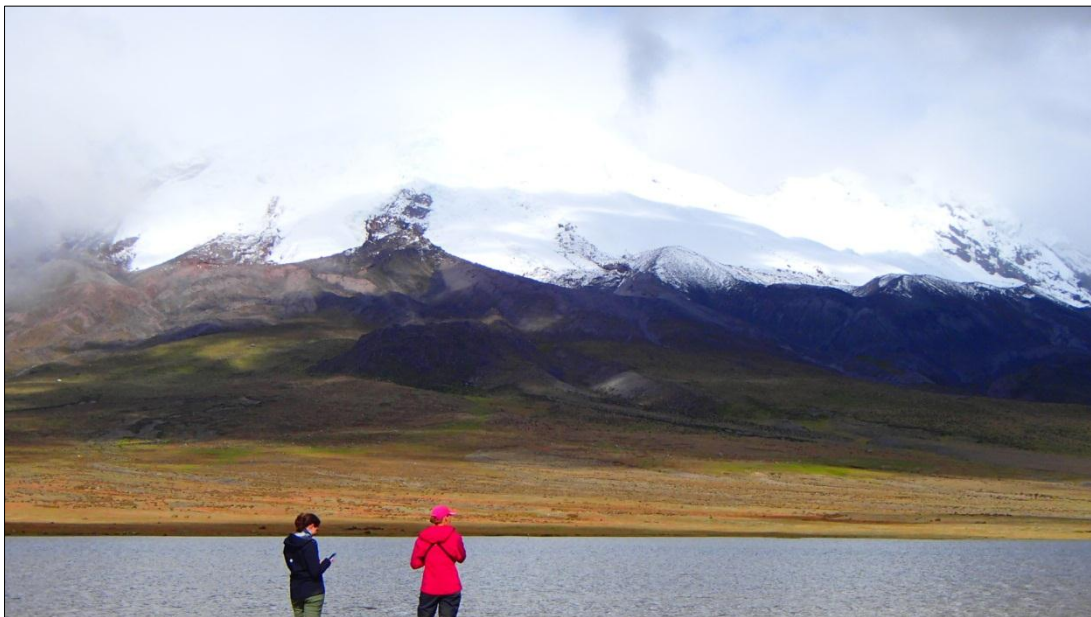
Santa Lucia Lake with Antisana in the Back

Topos Ecuador +593 98411 8063 toposecuador@gmail.com toposecuador.com