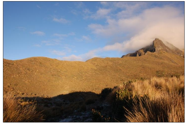
Rucu Pichincha in the morning

Eating properly and sleeping enough is crucial for a good body recovery, so make sure you enjoy some of Ecuador's cuisine and sleep early. Ask us for recommendations!