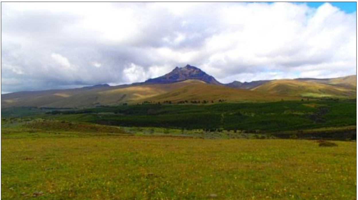
Sicholagua volcano from the trail head