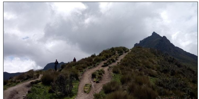
Trail to Teleferico