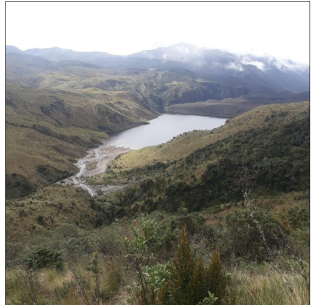
Tumiguina Lake. Camp in day 3 of the main trail

This is the most comfortable campsite in the hike. We will set our tents in soft mountain vegetation and we will be able to collect lumber to start a heartwarming fire. Lower altitude also helps for better rest and body recovery.