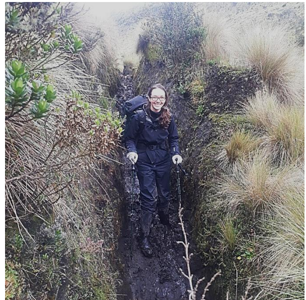
Enjoying the trail... even with mud