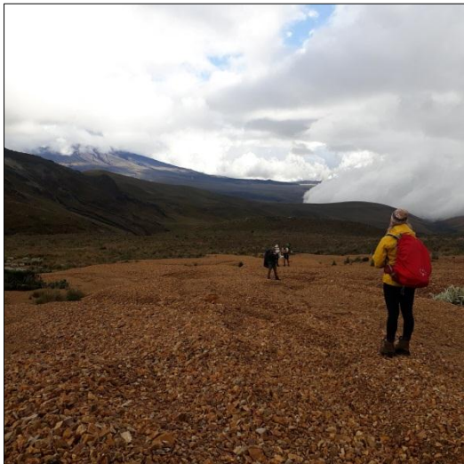
Sincholagua slopes with Cotopaxi in the clouds

The first day of the main adventure! Our transportation will pick us up at 6am from Quito and will drive us for about 2 hours to the north entrance of Cotopaxi National Park. After checking in with the Park Ranger we will start hiking towards east, facing imposing Sincholagua Volcano (4873m / 15,987ft). The hike this day is hard. We will climb most of the south west slope of Sincholagua, with an altitude gain of 800m / 2,624ft. The views and out-of-the-Earth landscape will absolutely worth the effort. We will reach camp around 4pm.