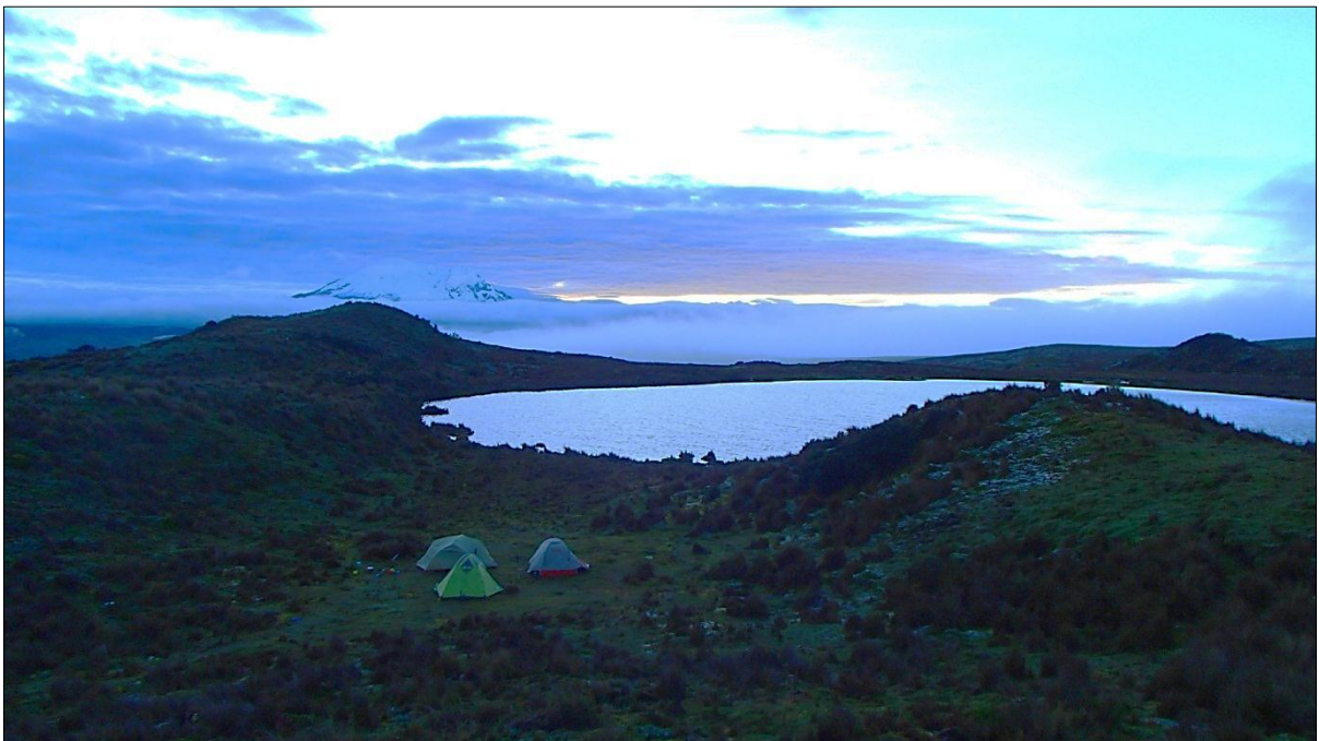
Taracocha Lake Camp. First night in the main trail